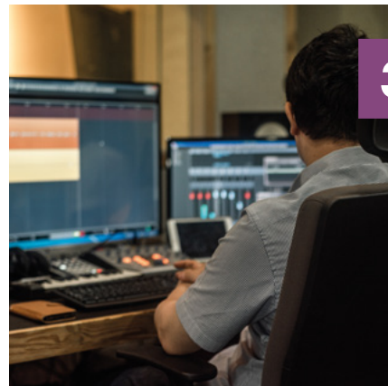
CAPTION: Open Doors partners broadcast Christian radio programmes into North Korea

Donations to appeals and allocated funds go entirely to ODI to distribute to Open Doors local partners. For a financial breakdown, you can find Open Doors' Annual Review at opendoorsuk.org .