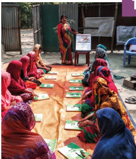
CAPTION: Women attend an adult literacy class in Bangladesh, giving them both skills and fellowship

Most often, people give to 'where most needed'. That means that the generosity of Open Doors supporters can be best used to meet the needs of persecuted Christians – sometimes where we cannot share openly about the work. It prevents projects being neglected, or given more funds than they can use. It also covers the overheads that ensure Open Doors staff can raise prayer, funds and awareness for the persecuted church.